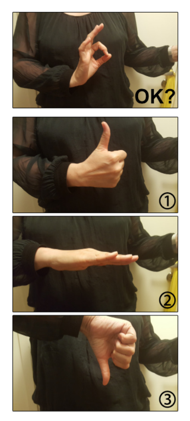
Fig. 2: OK Check-In Hand-Signs

As you try to shut such spontaneous contributions down, players may argue that familiar rules and tools are easy for them to use. That assumption is not inclusive of new participants or even factually correct for co-players from other play cultures. If some or all of your players come from a regional larp tradition with internally consistent design elements across events or systems, but your