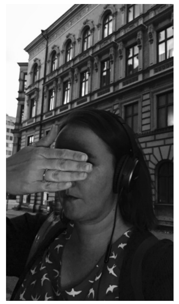
Fig. 3: The Lookdown

• If they stay, it means they'd like to continue the scene, but with just a little less of whatever was going on. Less screaming, less sexuality, less restriction of movement... Everyone dials it down a bit, and play continues. (See above under tap-out for more details about this).